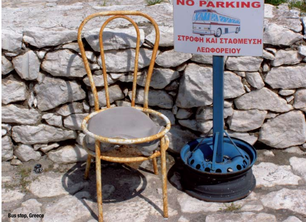
Bus stop, Greece