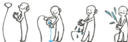
(Below, both images) Water garden , this work, which takes an appearance of a flower garden, is a tap in a public place. The tap is composed of an elastic stem along with flowers with various interfaces, and so it has diverse fabricating methods of compounding Design: Myoung Kim / BooYoung Park, www.odcd.org