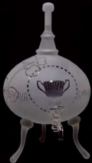
Bottled Carafe , inspired by the beautiful glass bottles of medieval times. Design: Kiki van Eijk, www.kikiworld.nl