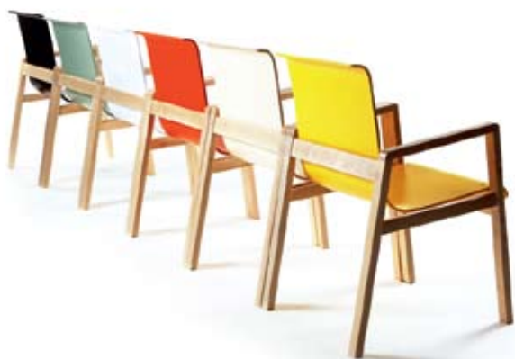
Hallway Chair 403 Design: design Alvar Aalto www.artek.fi