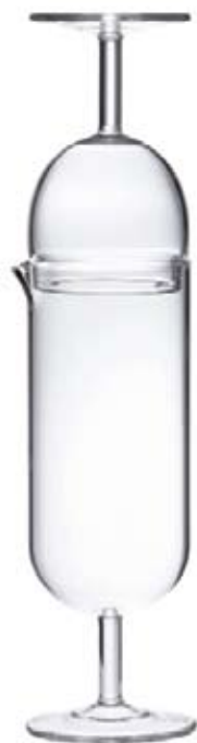
Sputnik , glass and carafe in heat-resistant mouth-blown glass Design: Guillaume Bardet www.ligne-roset.com